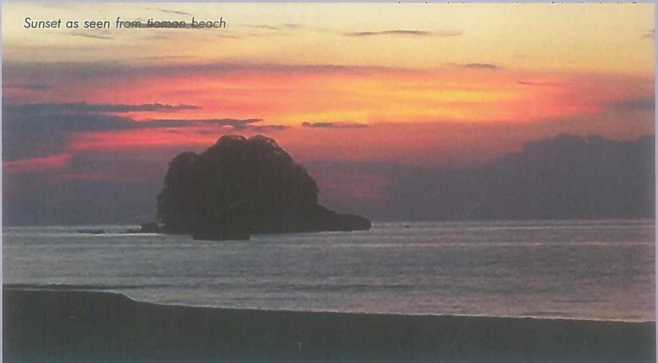
Sunset as seen from tioman beach

One meets tourists from countries as diverse as Singapore to Australia to Kuwait, as one plonks oneself on the many empty chairs scattered on the upper deck of one's ferry, with a bird's eye view of the horizon. The first ninety minutes are over choppy waters. One sees the faint outline of two huge volcanic rocks at a distance. As one gets closer, one sees a splash of green emerging out of the cobalt blue waters. The bottom of the ocean floor can be seen as the water is crystal clear. A speck of green appeared among the dark blue waters. It resembled a green sap- phire nestling in the palm of Nature's hand. The closer