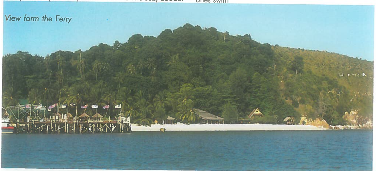
View form the Ferry

The view from one's chalet is breathtaking. The wide expanse of the rusty beach and azure sea, a stark contrast to the snow white clouds suspended above them, complete the picturesque scene from one's cozy abode. The warm waters and high visibility beckons one to slip into ones swim