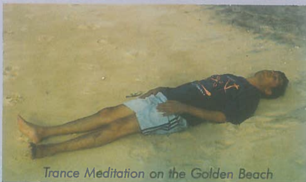
Trance Meditation on the Golden Beach

Island hopping, boating, snorkeling, scuba diving and bird-watching are some of the other activities one can indulge in once the novelty of the sea wears off. One can swim alongside a symphony of colourful fishes while enjoying the beauty of the coral reefs that adorn the ocean floor. Mushroom shaped cor-