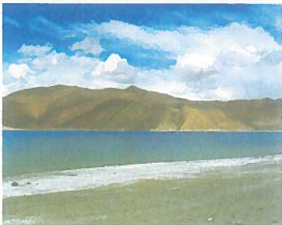
The sheer beauty of Mother Nature.