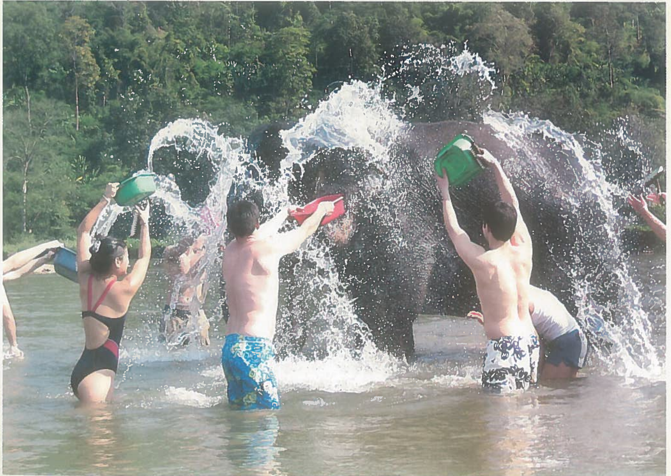
Tourists enjoying bathing an elephant

Watching the elephants spray water on themselves and others and playing with one another is a soothing experience. Bathing the elephant with a handheld shower and scrubbing them with coconut husks is a tough task. At the end you walk back through the thick evergreen forest and return to the cool confines of your room after a once in a lifetime experience. btw