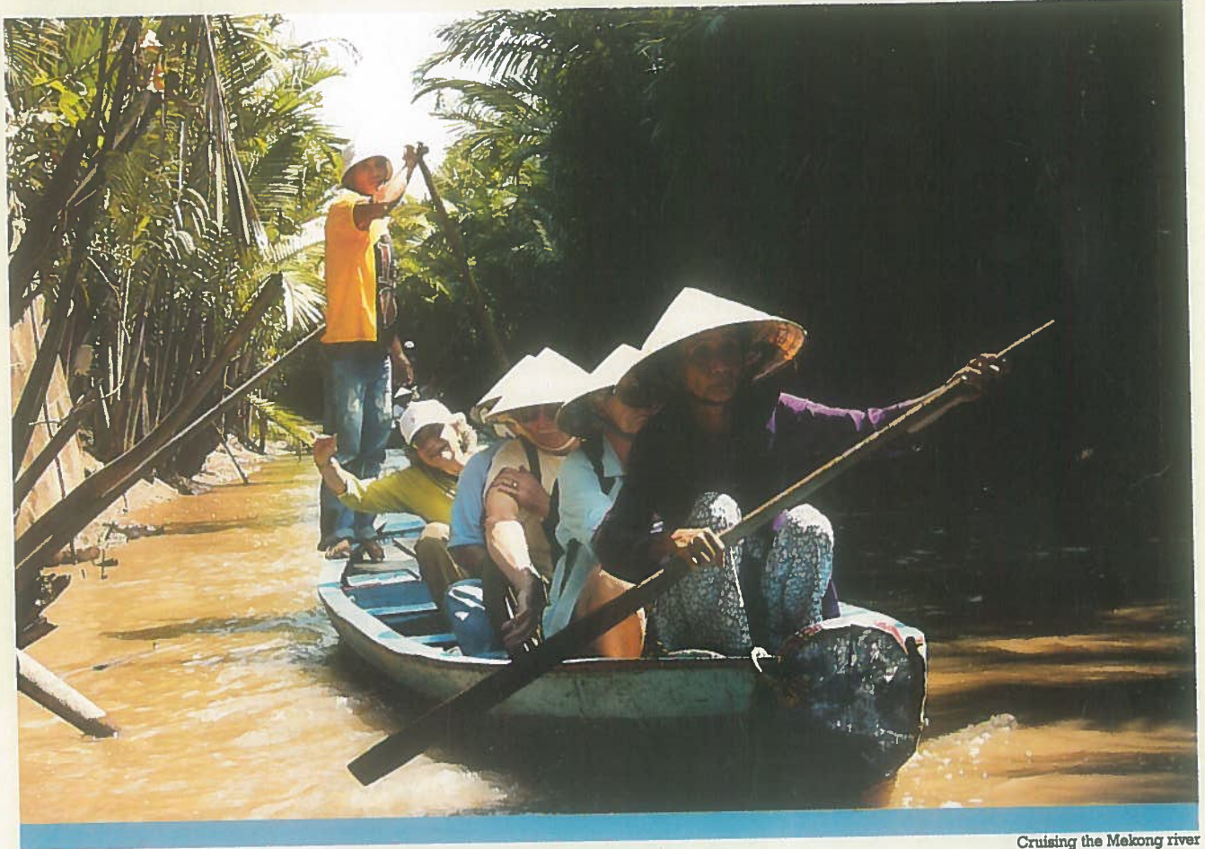
Cruising the Mekong river