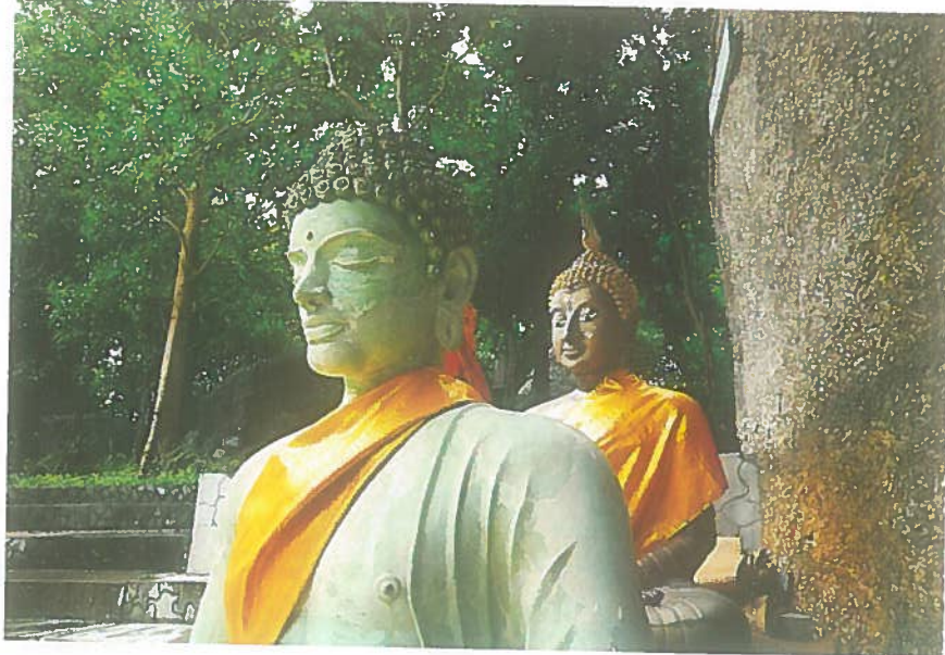
Buddha Statues In The Greens

After a thirty minute trek you come across a forest road which winds its way through the mangroves. A leisurely walk through this path, flanked on one side