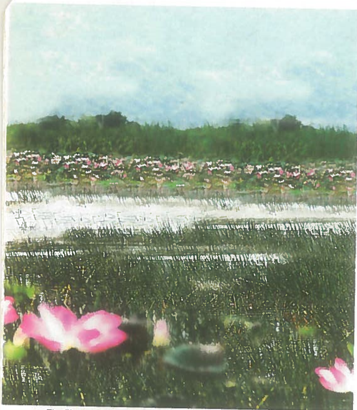
The Flowers At Sam Roi Yod Marine National Park

maggies can be seen nestling on the branches of the mangroves.