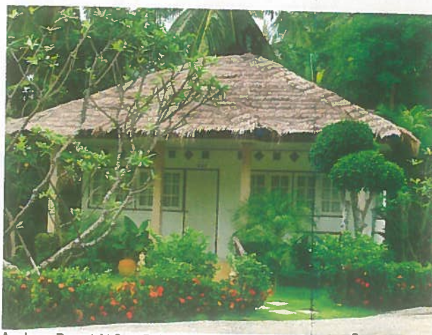
Anchana Resort At Sam Roi Yod

The nearest International airport to reach Sam Roi Yod National Park is at Bangkok. There are several options to get to Sam Roi Yod from Bangkok. By bus: The easiest and most popular way from Bangkok is by bus. Take the bus from Bangkok to Pranburi from the Southern Bus Terminal. This 250 km trip takes 200 minutes. The bus fare is 140 Baht for ordinary buses to 185 Baht for super-deluxe buses. Buses leave every half an hour. The first bus leaves at 6am and the last bus leaves at 6pm. From Pranburi motorbike taxis can be obtained to the main entrance of Sam Roi Yod National Park for 150 Baht. There is no entrance fee to the park.